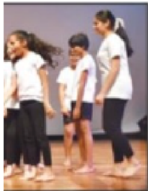
Children performing play 'Aap Hamare Hain'

The concerned departments are directed that all pending work should be completed and actions should be functioned before October 20 and direct presentations should be made to the DC. The DC gave deadline to the concerned departments to complete the work by October 17. He also instructed to complete the pending work and ensure its completion before October 25. The DC directed the concerned departments to shift the work to the concerned departments to 300-bed hospital and ensure that the formalities are put in place before the timelines prescribed by the administration. Further, the MS was asked to submit daily updates of progress.