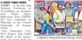
A memento being presented during valedictory function.