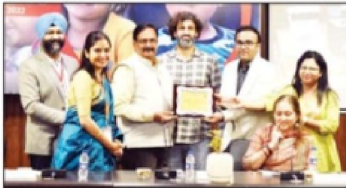
A memento being presented to a guest during valedictory of two-day conference at CUJ on Thursday.