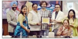
Scholars receiving certificates and prizes for presenting research papers in the two-day conference at Jammu.